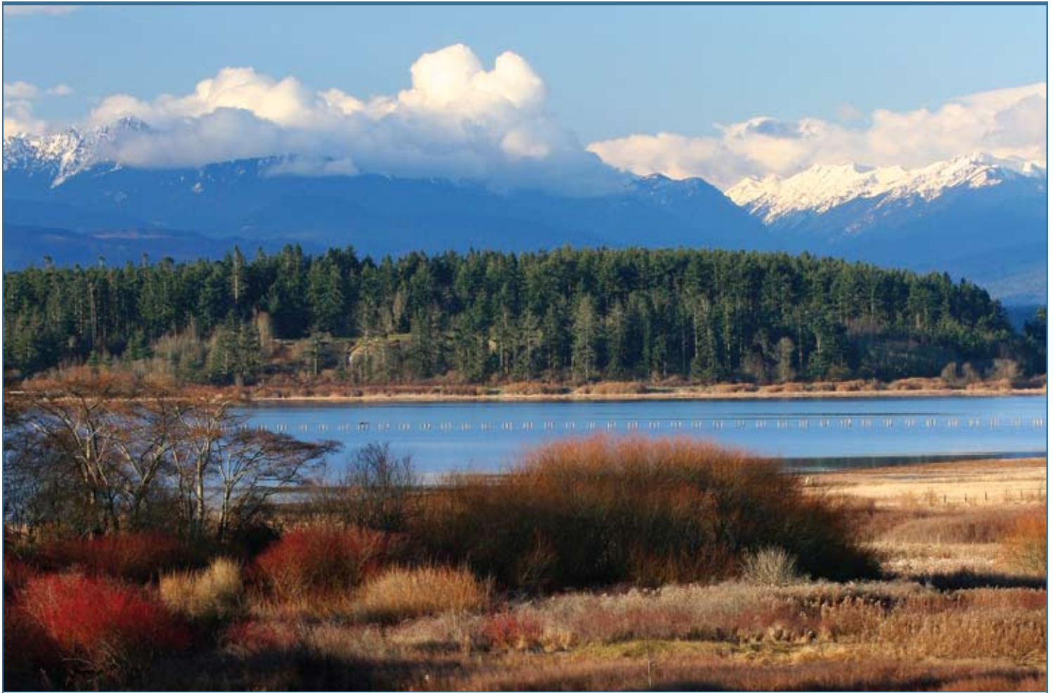
Crockett Lake, see page 6 for more details.