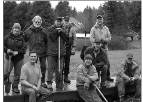
Photo: Volunteers planting native wetland species at our Hammons Preserve near Cultus Bay. Way to go team!