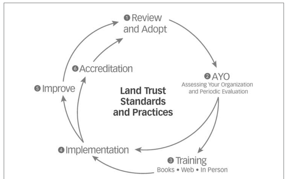
The diagram above shows the rigor and involvement required for accreditation. The numbered steps and arrows surrounding the Land Trust Standards and Practices serve as sign posts and directional indicators for land trusts to follow on their path to excellence. The circular form highlights the reality that knowledge is ever expanding and land trusts must continually learn and grow. Diagram by Rob Aldrich, Land Trust Alliance. For more information, go to www.lta.org .

and new policies. (Article adapted from "The Path to a Stronger Land Trust" by Rob Aldrich, Land Trust Alliance, Saving Land, Fall 2010).