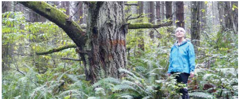
A hiker enjoys the Camano Ridge Forest Preserve on Camano Island.

The 400-acre Forest Preserve currently has only one trailhead, making it hard for many Camano residents to access its five miles of hiking trails. The property was logged two years ago and lies between Camano Ridge Road and the Preserve boundary—an ideal place to create a parking area.