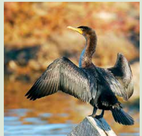
The Double-crested Cormorant (pictured above) and Northern Harrier (top photo) are each likely to lose more than 80% of their summer habitat range according to the new Audubon study.

Expecting displaced birds to move in and share habitat with existing bird species leads to competition for food, nesting sites and resting habitats. It's like coming home to find that an unknown family from Arizona has moved into your house and is eating your food and sleeping in your bed.