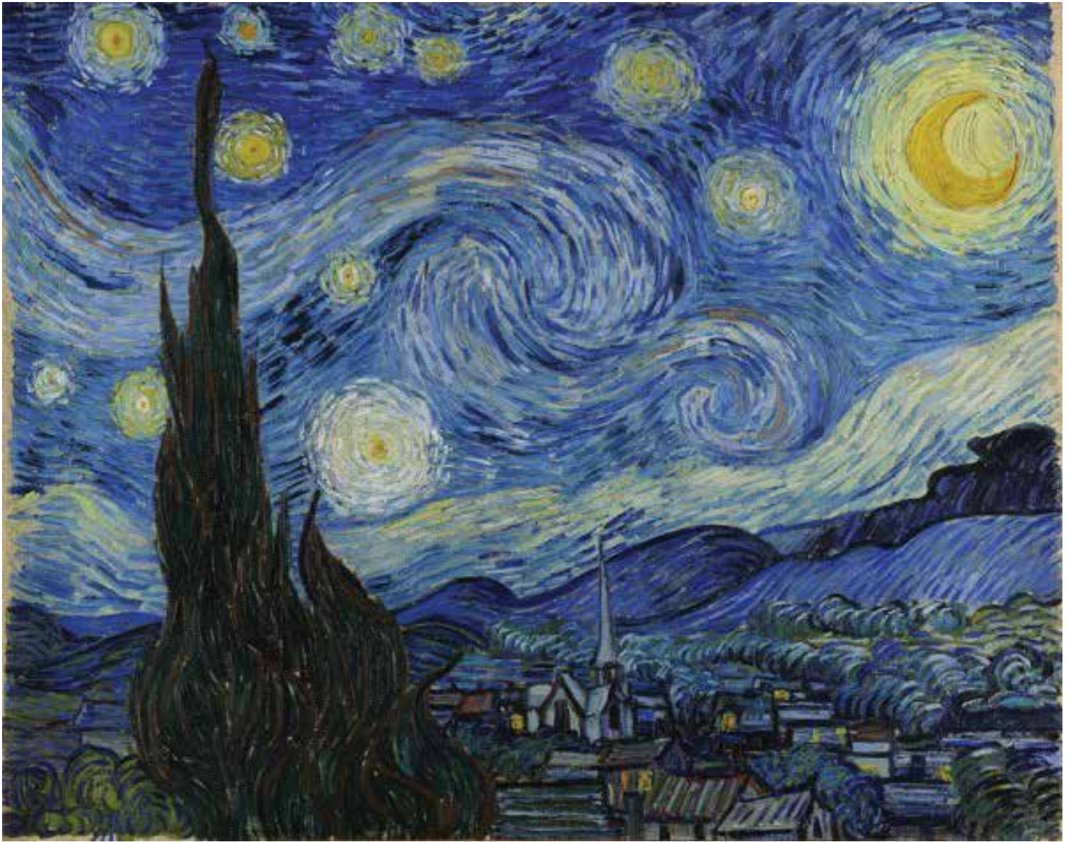
Vincent van Gogh's The Starry Night oil on canvas painted in 1889, is one of his best known works.