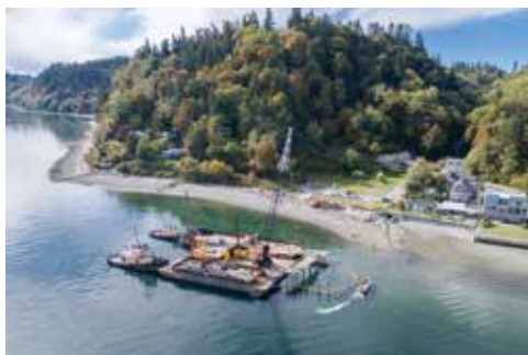
Denis Hill captured the removal of creosote-treated wooden structures at Glendale Beach (shown here) and Waterman Shoreline in a series of aerial photographs.