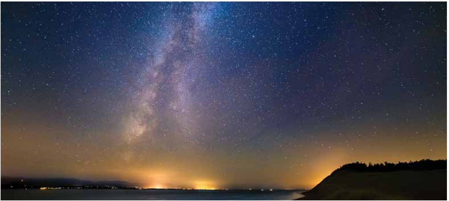
This view of the Milky Way over Ebey's Landing showcases our dark skies. The glow of lights from Port Townsend indicate that those viewing the sky from there will not enjoy the same spectacular view.