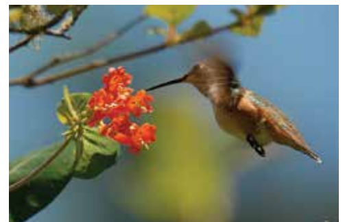
of a Rufous Hummingbird was used in the spring newsletter announcing a new pollinator garden at Saratoga Woods.