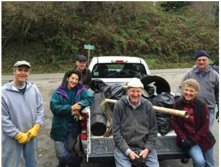
Volunteers remove a truckful of trash from the Waterman Shoreline Preserve.

Interested in volunteering? Please contact Kyle Ostermick-Durkee at 360.222.3310 or kyle@wclt.org .