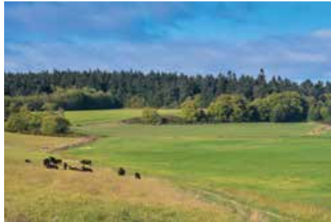
Dave Wechner took this photo showcasing the beauty of Fakkema Farm, helping us share the protection of this important landscape.

Sometimes, such as with Holly Davison's night sky photo used on page 3 in the cover story of this newsletter, we ask a photographer for permission to use certain photos. On other occasions, we ask Land Trust supporters and volunteers to take photos of specific places. In 2016, many of you gladly shared your photos and accepted photo assignments to capture the images we needed to tell the year's important stories. We're grateful to you for sharing both your time and the priceless images featured here, along with many others.