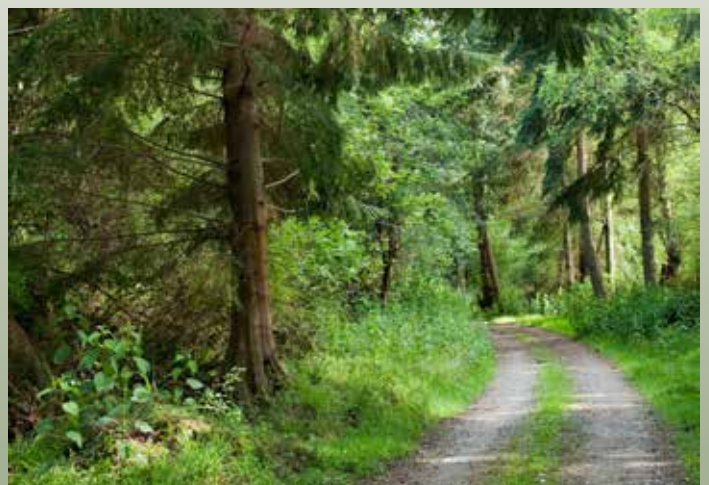
With the help of volunteers, the Land Trust manages more than 6.5 miles of trails in the Community Forest.

18341 State Route 525, Freeland, WA 98249