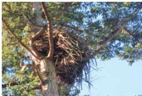
This eagle's nest is one of the many images that Tom Eisenberg captured at Bamum Point for use in our spring newsletter and fundraising materials.