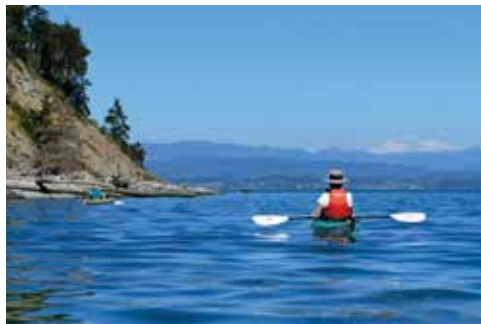
Barbara Brock graciously accepted an assignment to capture this and other kayak photos at Bamum Point; it was critical for grant presentations.