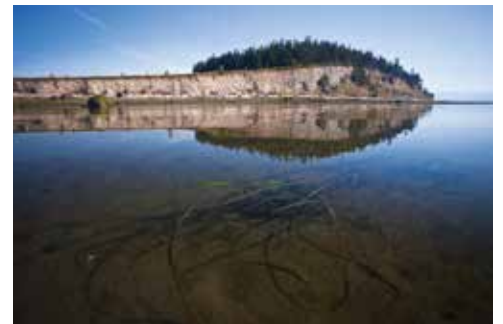
Benjamin Drummond shared this and many other photos to help us showcase Bamum Point in grant presentations and fundraising materials.