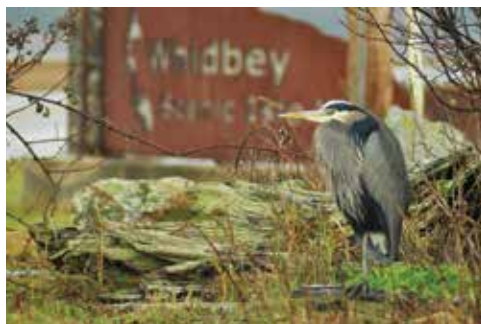
Cara Hefflinger submitted this beautiful image to our Calendar Photo Contest. This photo is featured on the month of August in our 2017 calendar.