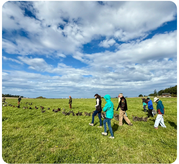
Guided Walk & Talk at Beach View Farm.