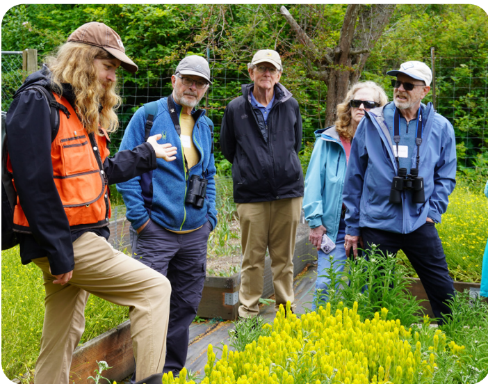
Golden Paintbrush Tour at Admiralty Inlet Preserve.