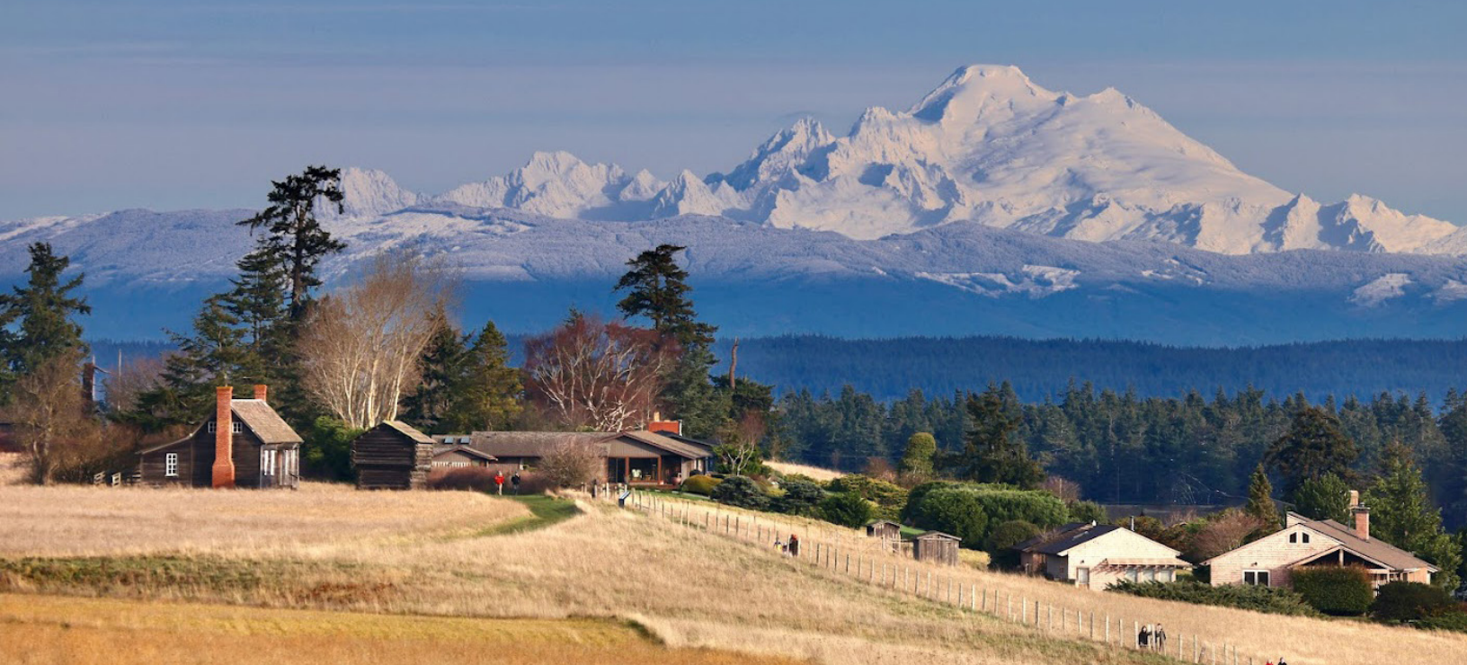
View of Mount Baker from Ebey's Landing.